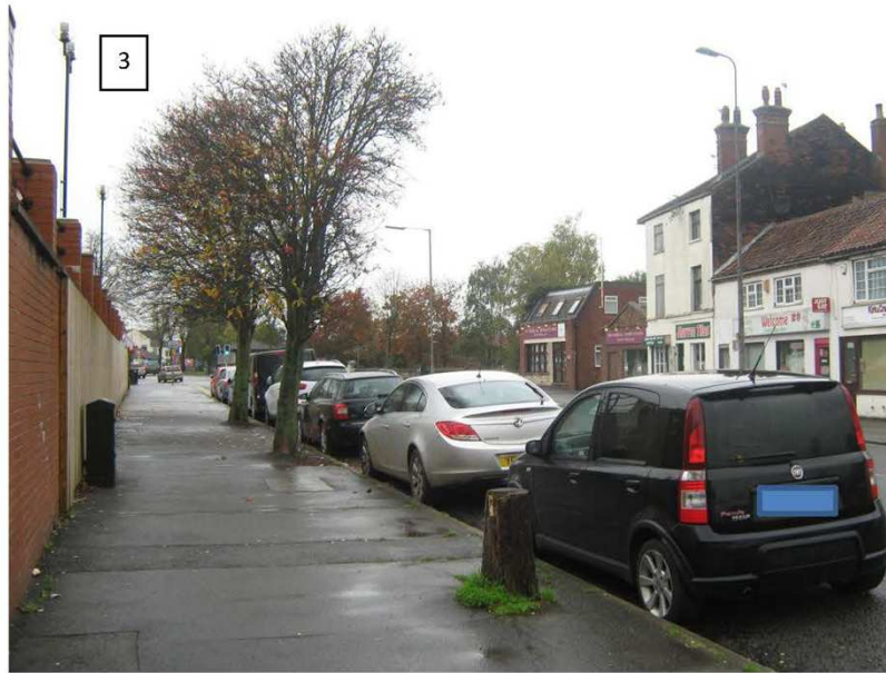
Photograph 3: Facing North from Retail Park entrance.