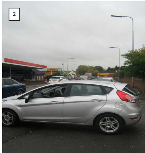
Photographs 1 & 2 – Looking South: View from a motorist exiting Retail Park: lack of visibility due to parked vehicles.