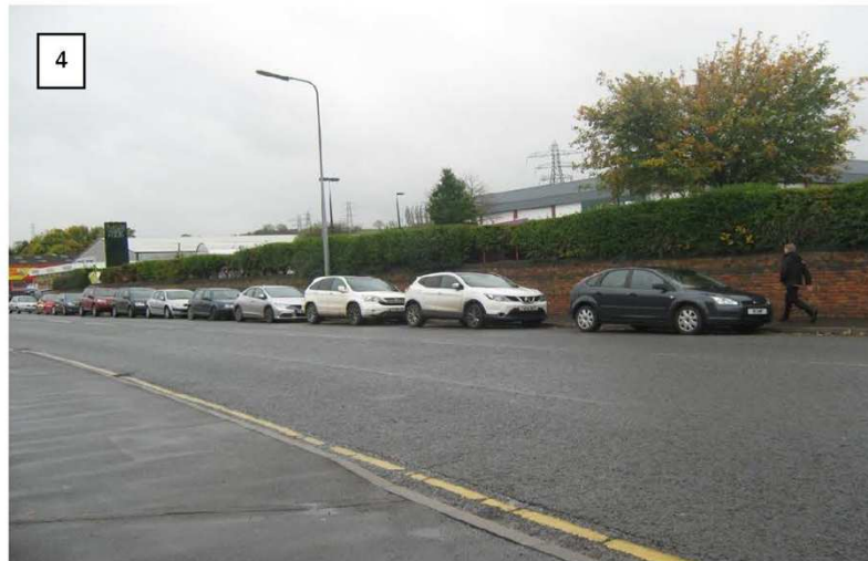
Photograph 4: View of western side of carriageway